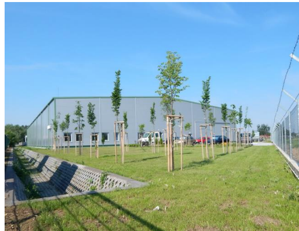
Company premises in Kecskemét

HETECH is constantly improving the design and operating parameters as well as the controls for its dryers manufactured in Hungary: