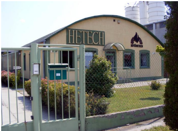
Main building in Kecskemét

HETECH is known far beyond the borders of Hungary as an expert in the design and construction of grain dryers with integrated moisture measurement. The drying of grain is an essential requirement for safe long-term storage. The dryer has been integrated into the machine to machine processes working continuously. The moisture content of the harvest to be dried is measured, monitored and controlled down until a suitable level is reached ensuring safe long-term storage conditions.