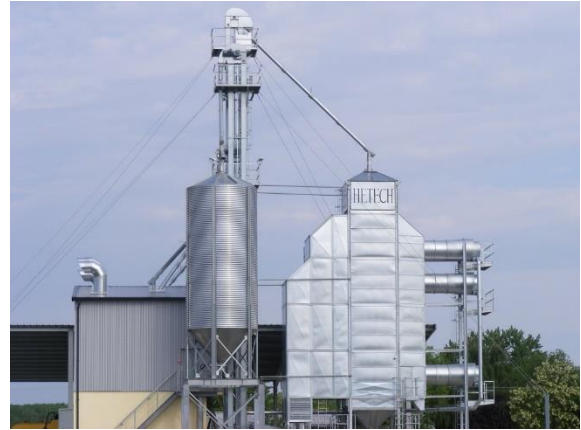
Plant in Tiszakürt

HETECH is celebrating its 23rd anniversary in 2021 and we are already working together for 12 years. We look forward to the next 12 years and continuation of our a good and fruitful cooperation.