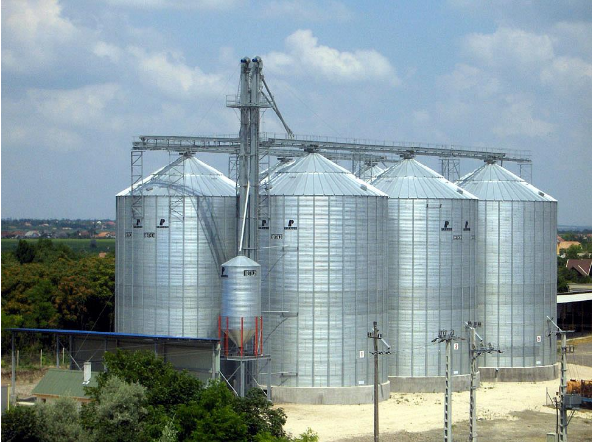
Plant in Adony

It is also the company's declared goal to manufacture reliable dryers, especially for Hungary and its neighboring countries, which enable the harvest to be stored in a stable manner and sustainable conditions. The scope of services is adapted to regional and individual needs of the operator.