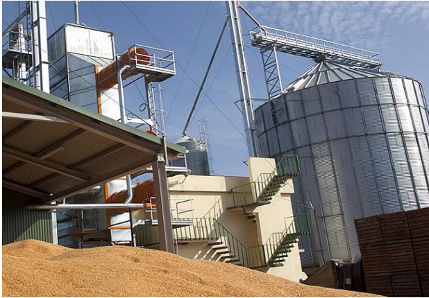
Plant in Dombegyház