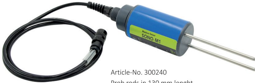
Article-No. 300240 Prob rods in 130 mm length